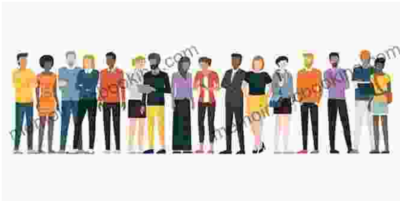
Image: Actors as conduits for human experience

Performers are the heart and soul of plays, bringing characters to life with their interpretations and artistic expression. The book recognizes the transformative journey that performers embark on, as they delve into the depths of human emotion. Performers become catalysts for change, not only on stage but also in their personal lives.