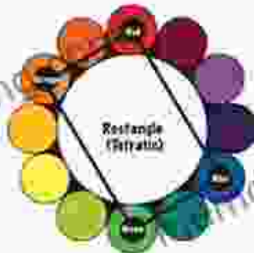
Rectangle (Tetradic) color scheme This scheme is based on two complementary pairs. Colors arranged in a rectangle are complementary pairs.